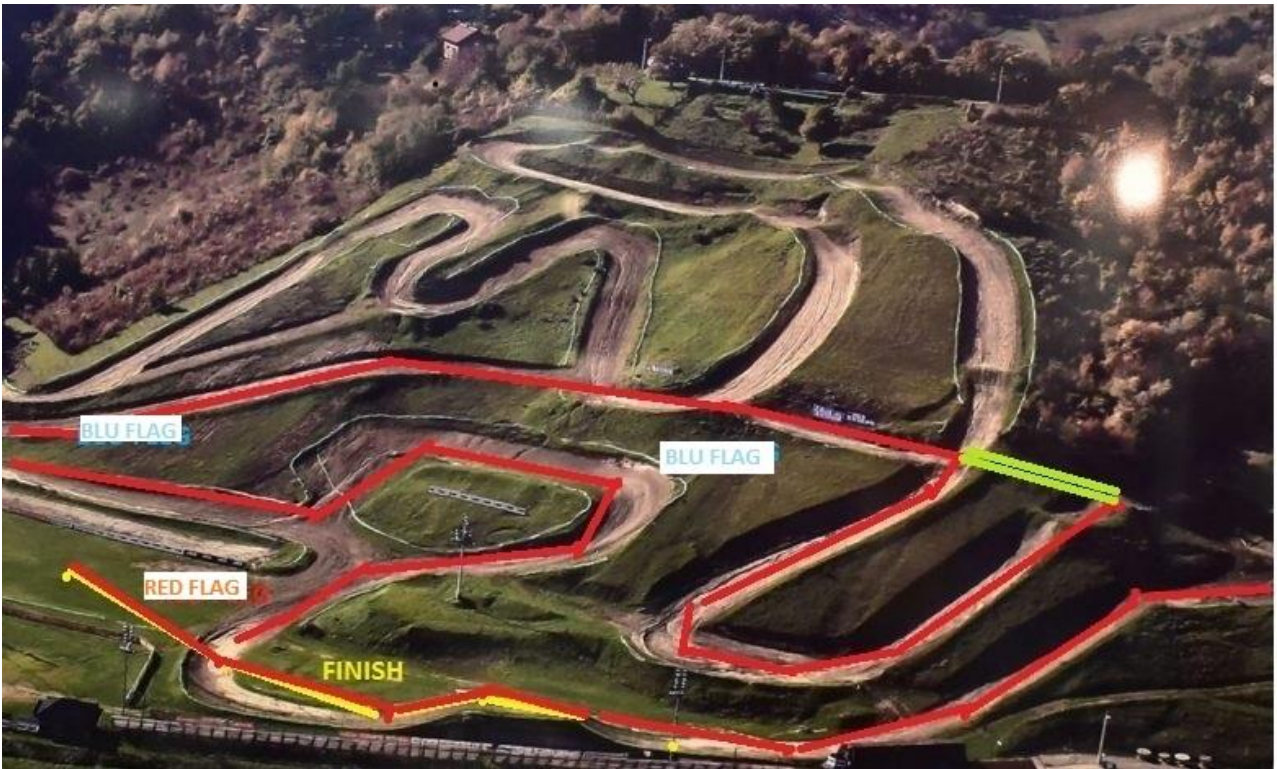
TRACK EMX 65 SW YELLOW MARKED EMX 65, POSSIBILITY OF SHORTENING