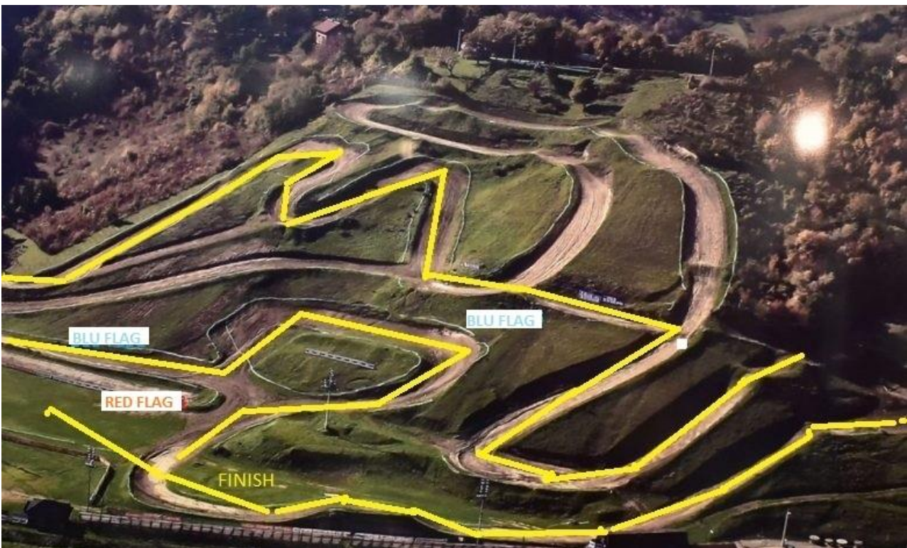
TRACK EMX 85 SW